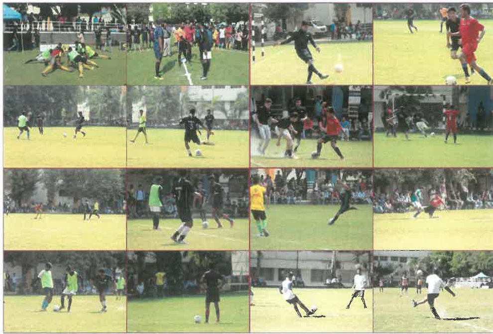
Gimpses of Football Matches