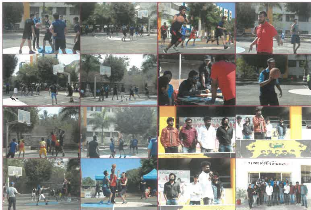
Gimpses of Basketball Matches