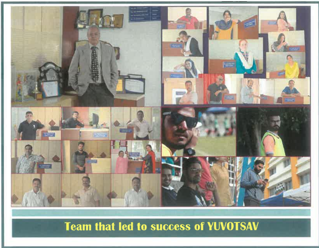
Team that led to success of YUVOTSAV