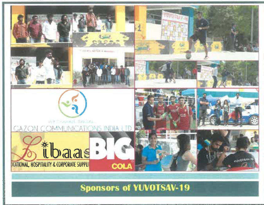
Sponsors of YUVOTSAV-19