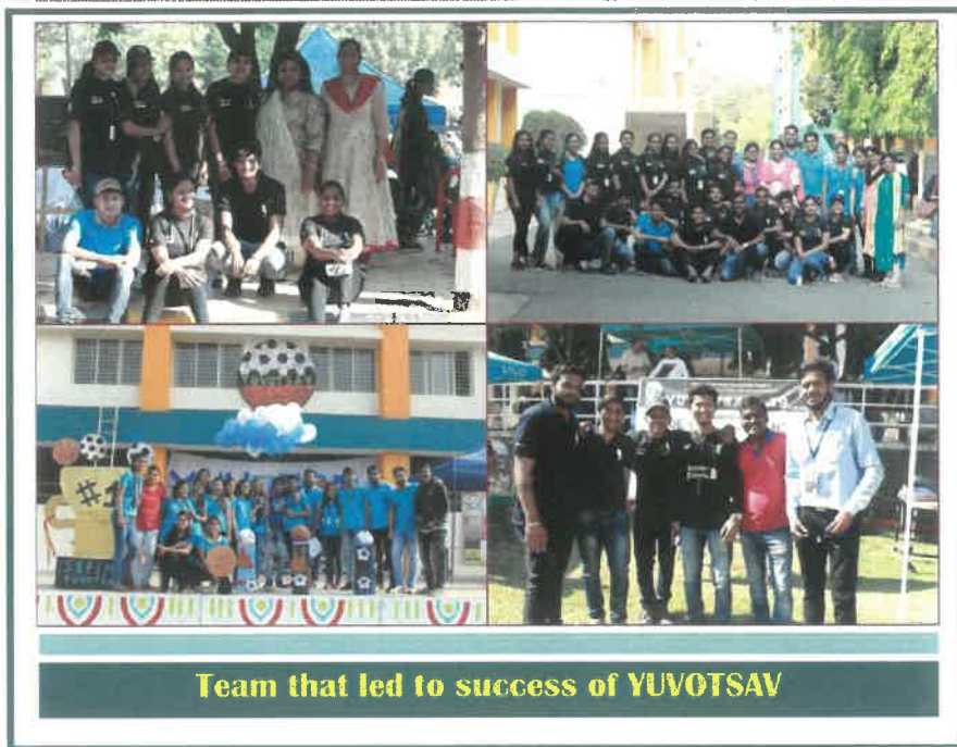
Team that led to success of YUVOTSAV