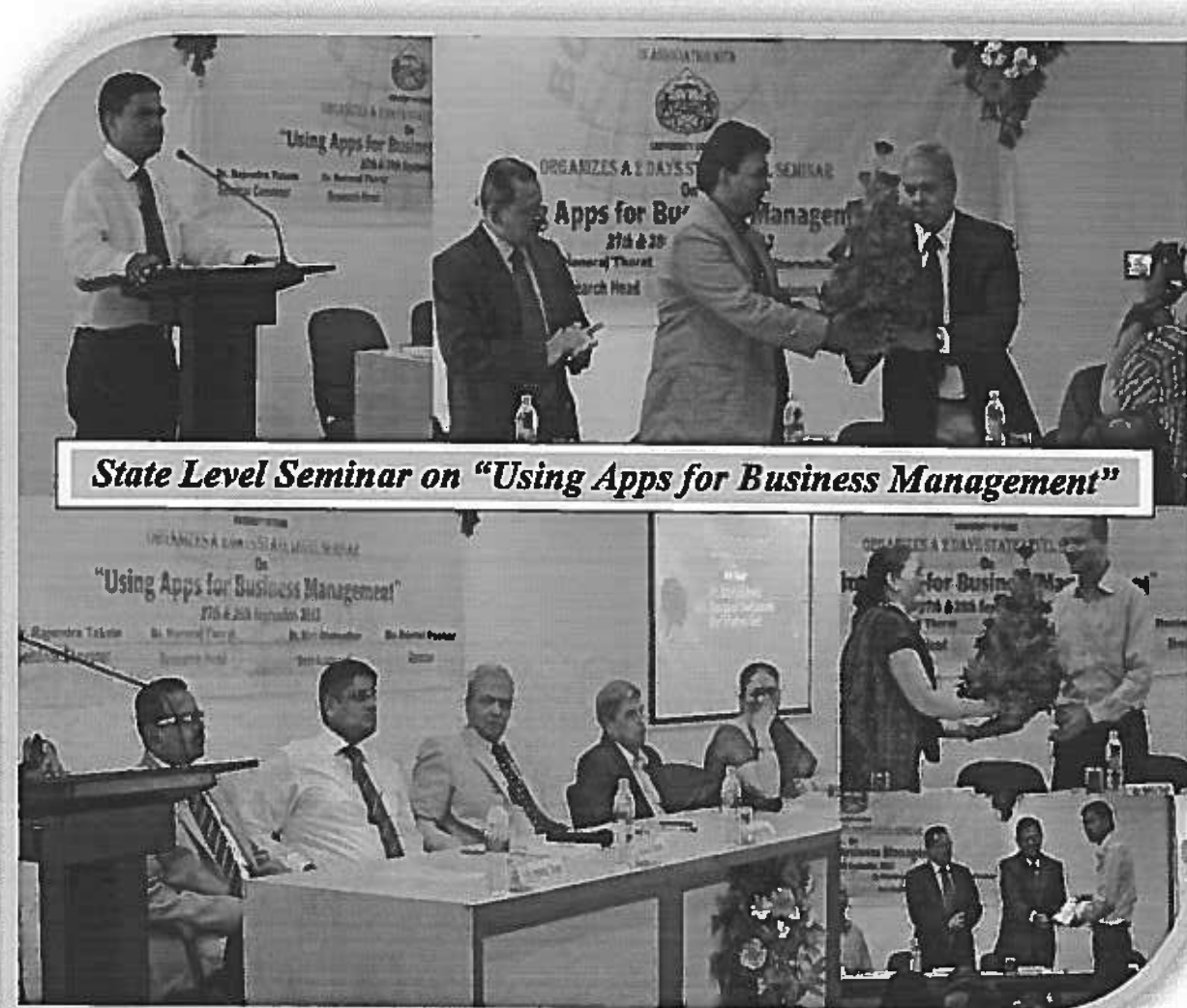
State Level Seminar on “Using Apps for Business Management”