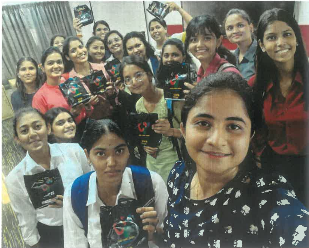
Excited SBPIM girl students with the gift hamper from Whisper and Gillet Venus