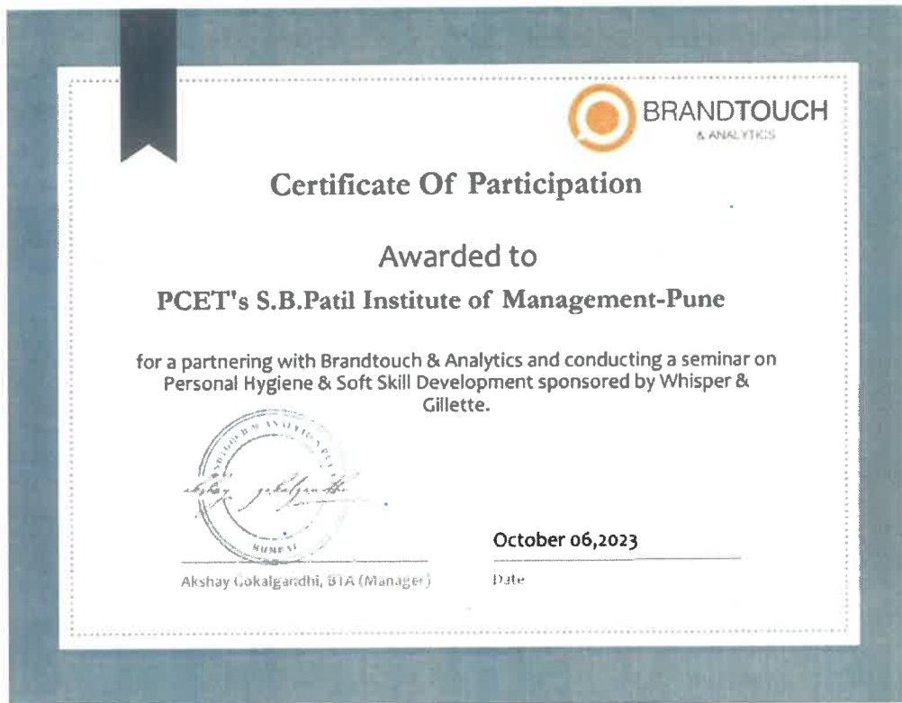
Appreciation Certificate to SBPIM from Brandtouch & Analytics