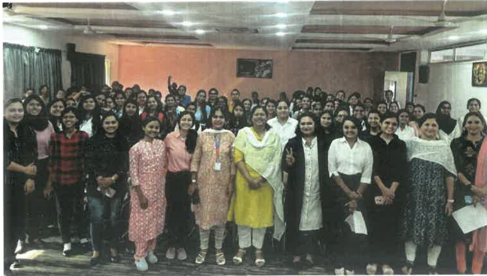
Aware and Happy faces at the end of the session