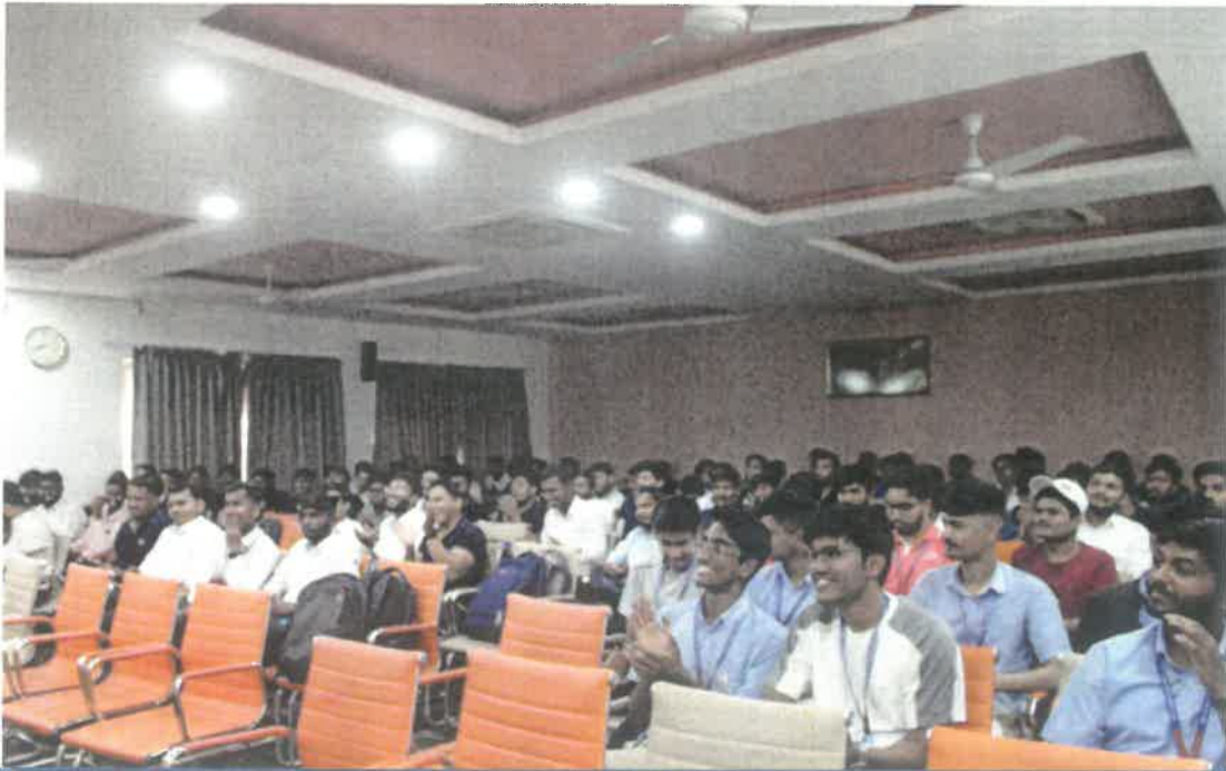
Students while attending the sessions on Unlock the Power of "Magic Mantras for MBA"