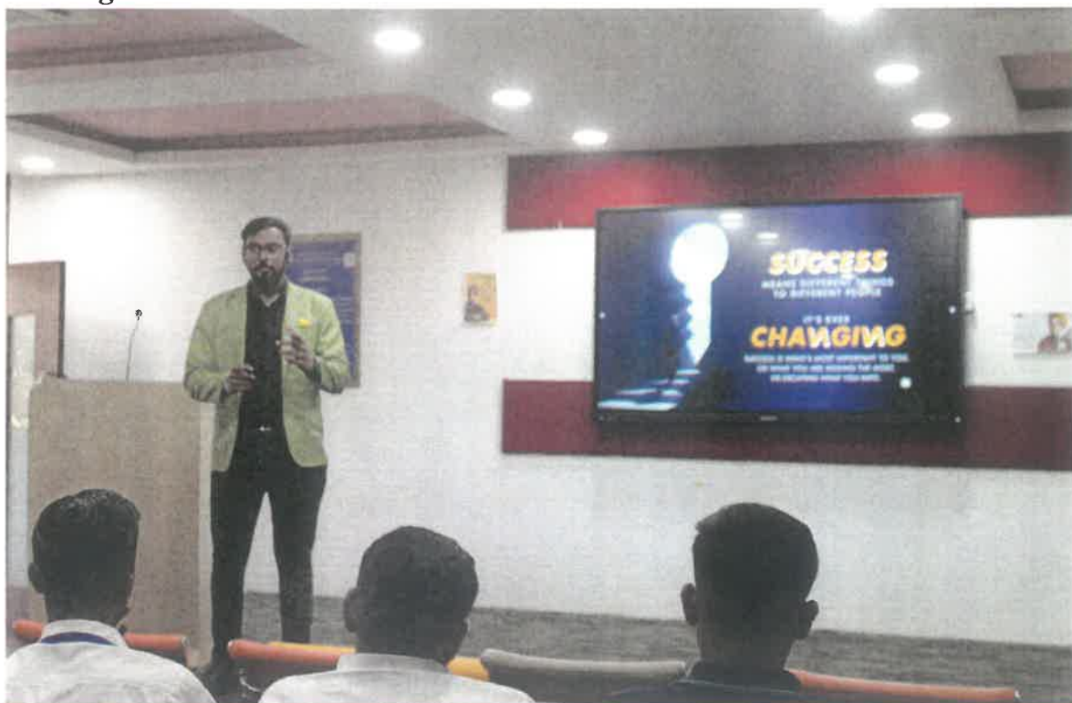
Guest Session by Gillette in association with Sakal YIN Topic: Unlock the Power of "Magic Mantras for MBA"