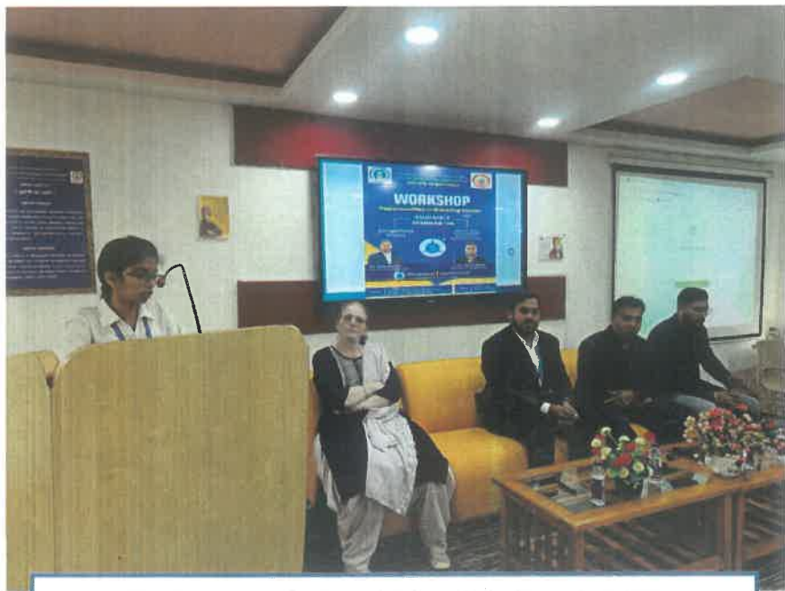
Student giving the introduction of the Guest Speaker