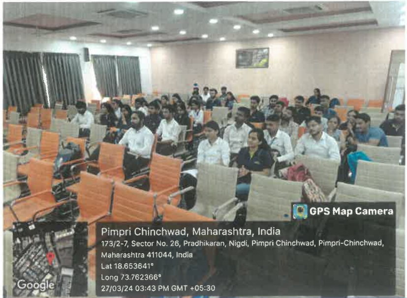
Students attending Guest Session on Opportunities in the Banking Sector