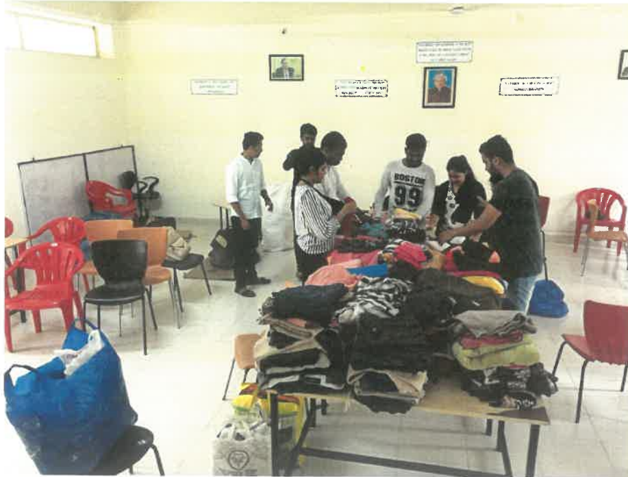
Students sorting clothes for donation at Kolahapur