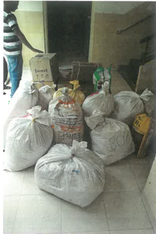
Food material , clothes, food grains and medicines packed and ready for donation