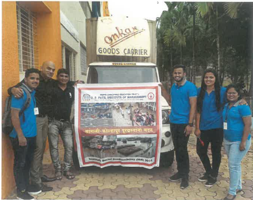
Students Ready with material to be shipped to Kolapur