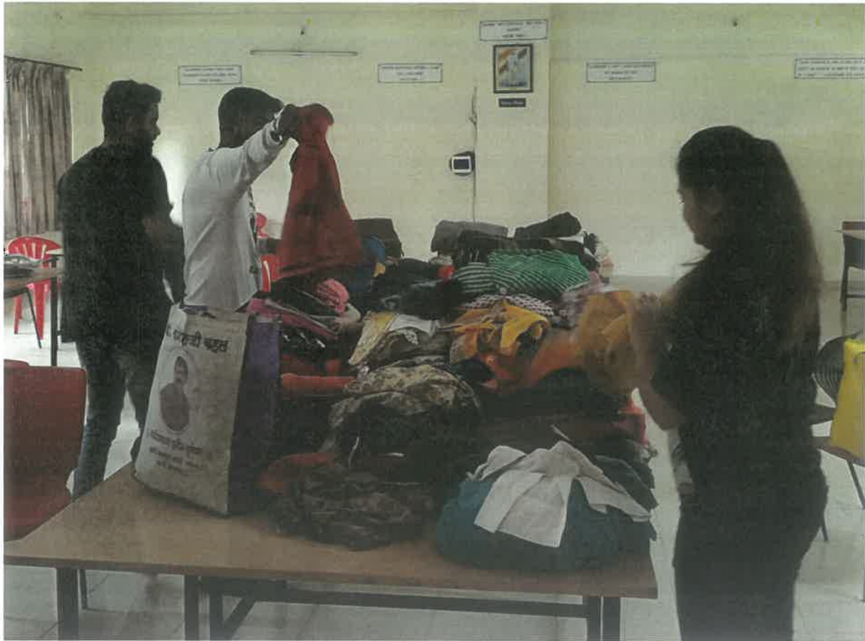
Students Collecting clothes for donation at Kolahapur