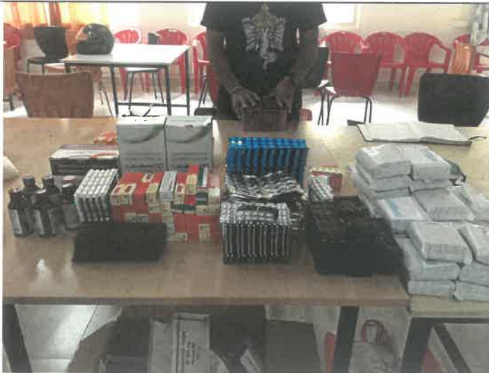
Medicines purchased as requested by the Prathamik Arogya Kendra, Savarde, Taluka Hatkanangale