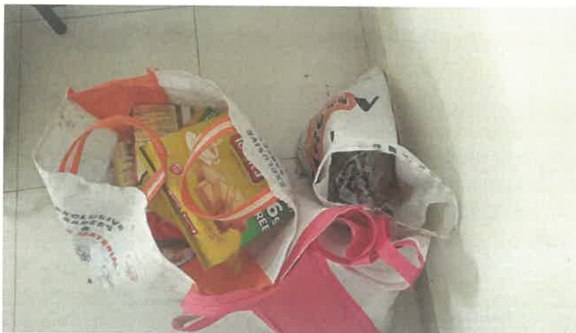
Eatables collected by the students for the Donation