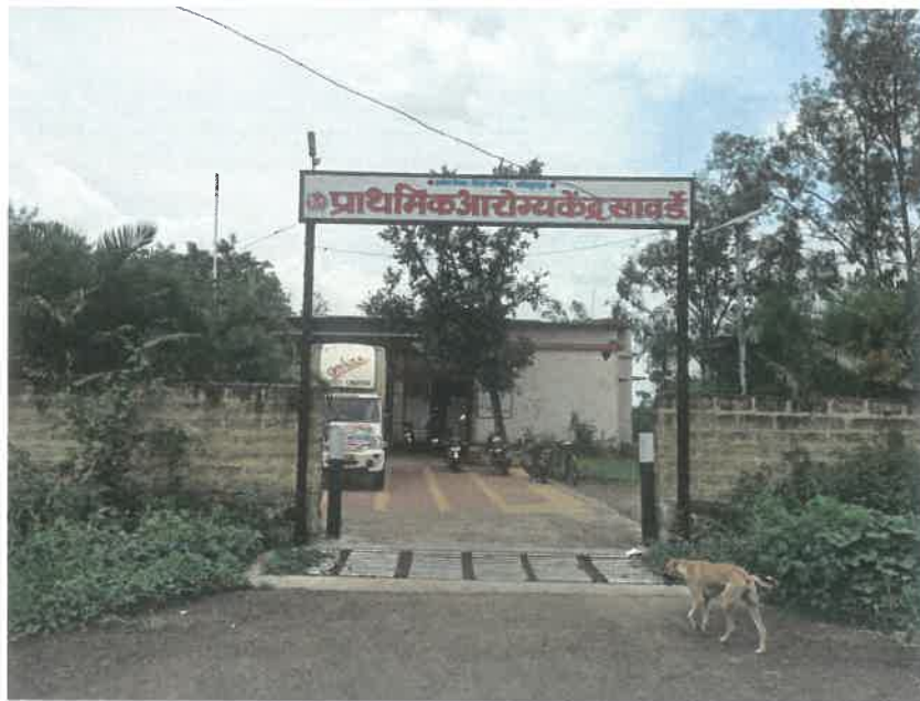
Donation material shipped at Prathamik Arogya Kendra, Savarde, Taluka Hatkanangale