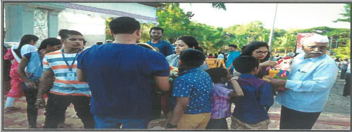
Students helping the devotees to dispose the Nirmalaya

Ganesh Talav Sector No. 26, Pradhikaran, Nigdi, Pimpri-Chinchwad, Maharashtra 411044