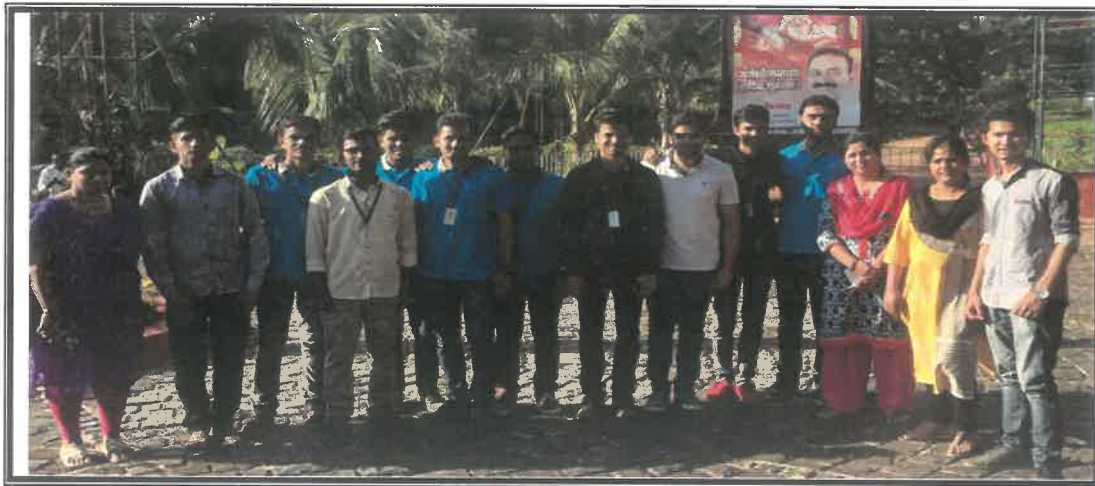
Faculty and student volunteers at Ganesh Talav

Ganesh Talav Sector No. 26, Pradhikaran, Nigdi, Pimpri-Chinchwad, Maharashtra 411044 Lat 18.65508° Long 73.76258° Date-17/09/2018