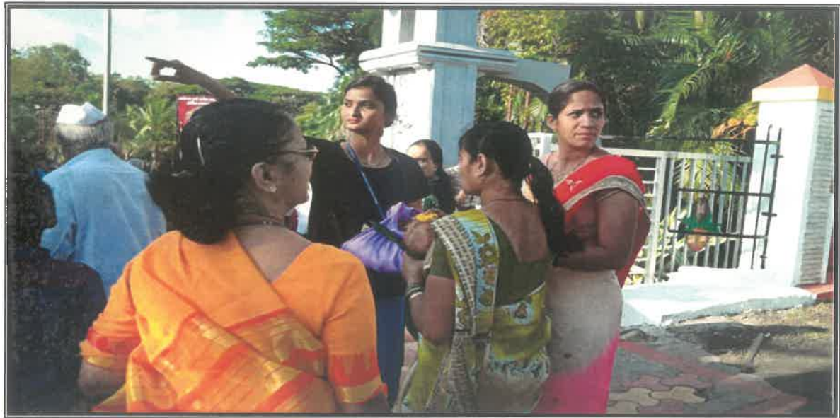
Students Directing the Devotees

Ganesh Talav Sector No. 26, Pradhikaran, Nigdi, Pimpri-Chinchwad, Maharashtra 411044