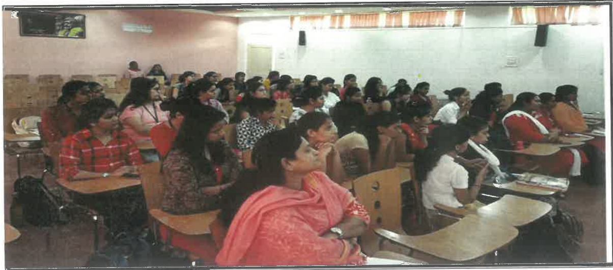
Female staff and Students engrossed in the session