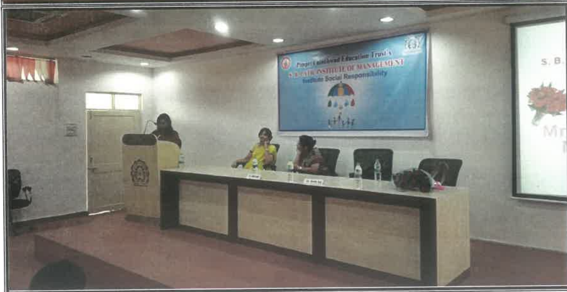
Student of SBPIM is introducing the Guests of the event