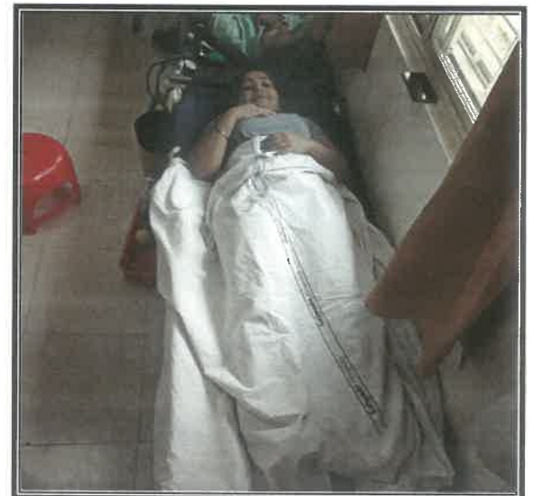
(Students and Staff members are donating blood at SBPIM)