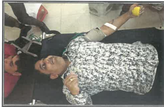
(Students and Staff members are donating blood at SBPIM)