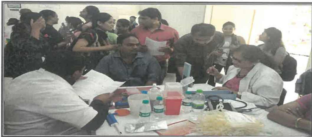
(Donors are asking questions and interacting the Doctors of Indian Red Cross Society & Partnering Sahyadri Hospitals)