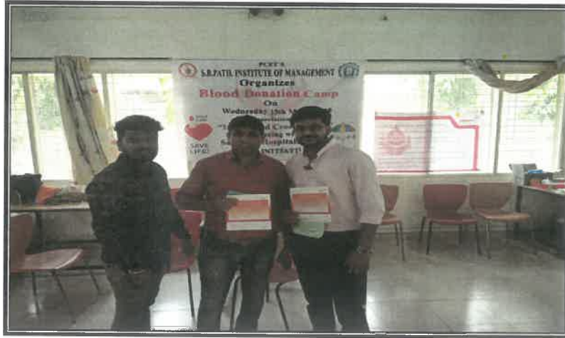
(Donors are receiving Certificate of Appreciation from Indian Red Cross Society & Partnering Sahyadri Hospitals)