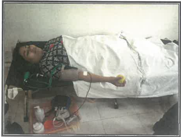
(Students and Staff members are donating blood at SBPIM)