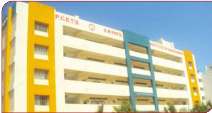
S. B. Patil Institute of Management www.SBPATILMBA.com