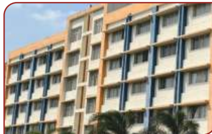
Pimpri Chinchwad College of Arts, Commerce and Science www.pcacs pune.com