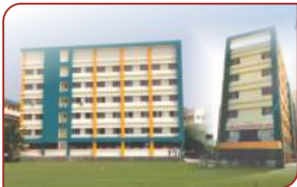
S. B. Patil College of Architecture & Design www.SBPATILARCHITECTURE.com