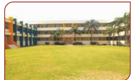
Nutan College of Engg. & Research www.NCERPUNE.in