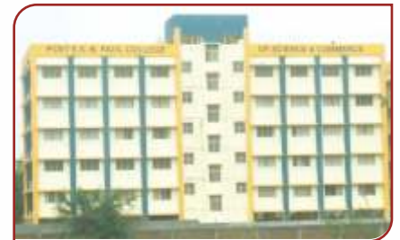
S. B. Patil College of Science & Commerce www.SBPATILCOLLEGE.com