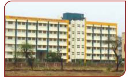
Pimpri Chinchwad College of Engineering & Research www.PCCOER.com