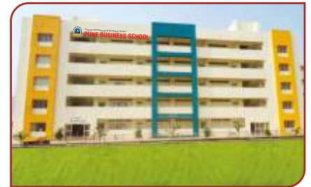
Pune Business School www.PUNEBUSINESSSCHOOL.com