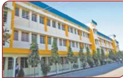
Pimpri Chinchwad Polytechnic www.PCPOLYTECHNIC.com