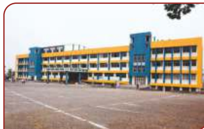
Nutan Maharashtra Institute of Engineering & Technology www.NMIET.edu.in