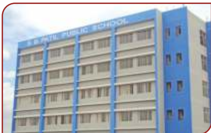
S. B. Patil Public School www.SBPATILSCHOOL.com