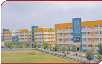
Pimpri Chinchwad College of Engineering www.PCCOEPUNE.com